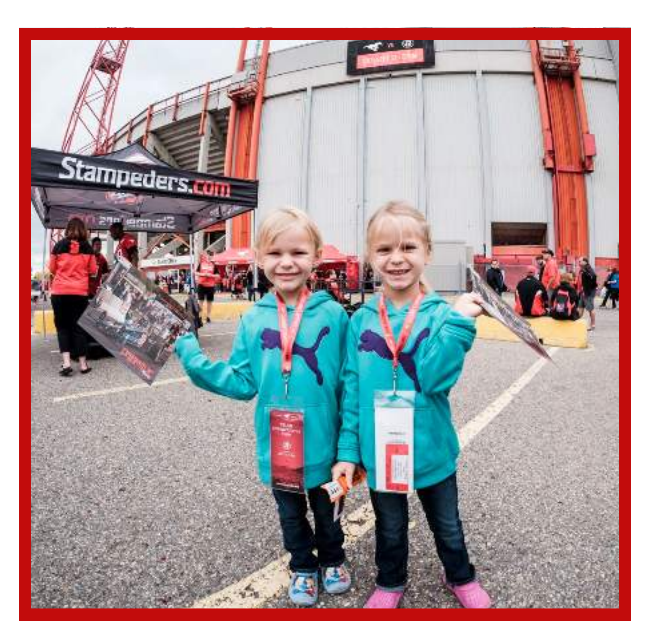
Sister's proudly display their autographed Dark Side Racing hero cards at the September 17, 2016 Calgary Stampeders tail gate event. Pictures were featured on the Stamp's website

Top Fuel drag racing is considered by many to be the ultimate and original extreme sport, and interest in extreme sports is booming! Drag racing's universal appeal stems from the fact that it is a true family sport. Add to that the affordable ticket price and you have an activity with mass family appeal.